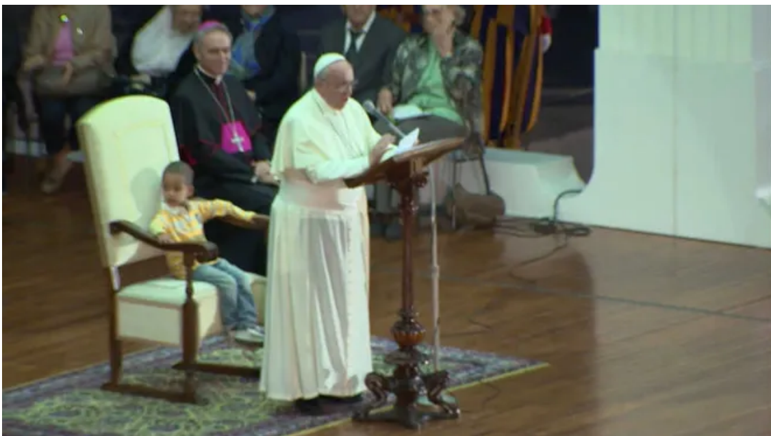
October 2013; Pope Francis lost his chair, and didn't seem to mind.